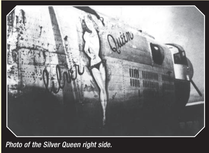
Photo of the Silver Queen right side.